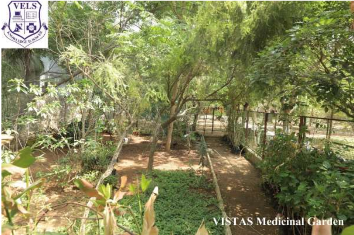
VISTAS Medicinal Garden