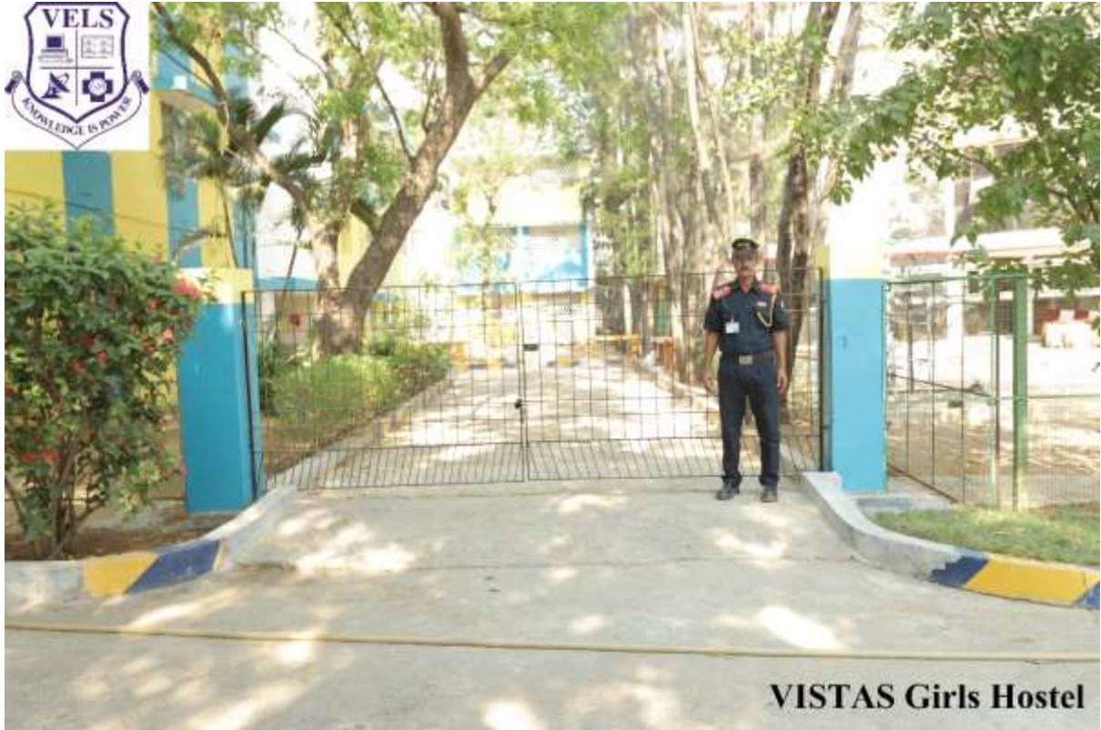
VISTAS Girls Hostel